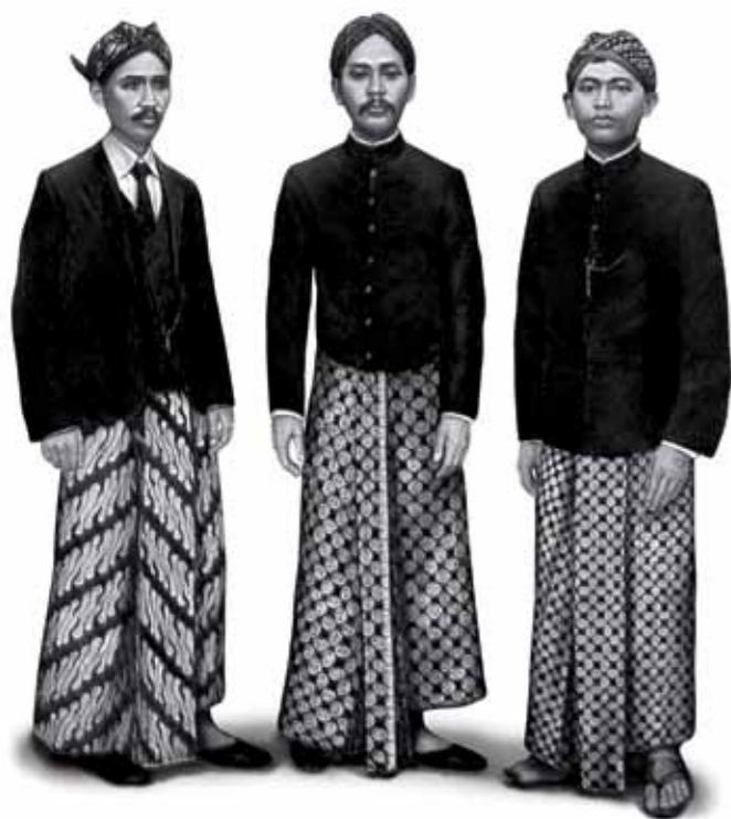
Founders of AJB Bumiputera 1912